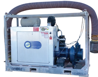
10" Dri-Prime Vac Pump