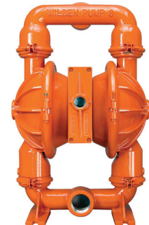
2" Air Diaphragm Pump