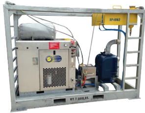
4" Centrifugal Pump