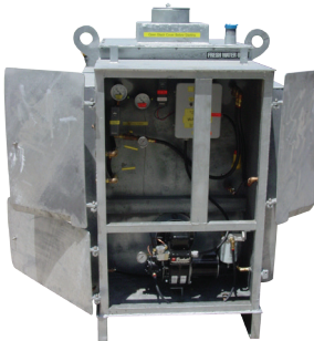
Diver Hot Water Unit