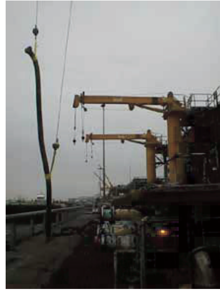
HH Hose handling slings